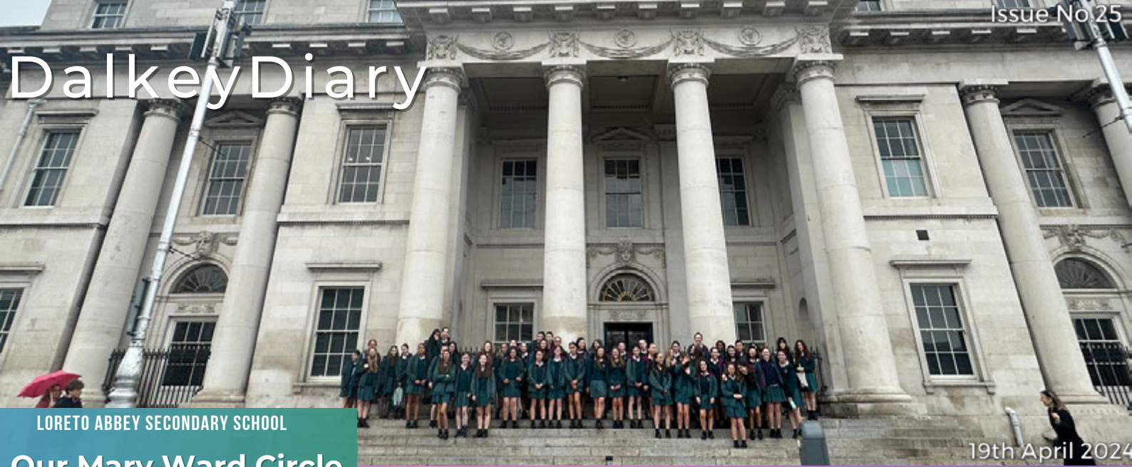
LORETO ABBEY SECONDARY SCHOOL