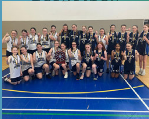
The Minor A Basketball team reached the Loreto Final this week, with the result 25-24 to Loreto Beaufort.