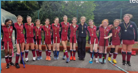
The Minor 5s reached the Loreto Final this week with a score of 1/0 to Beaufort.