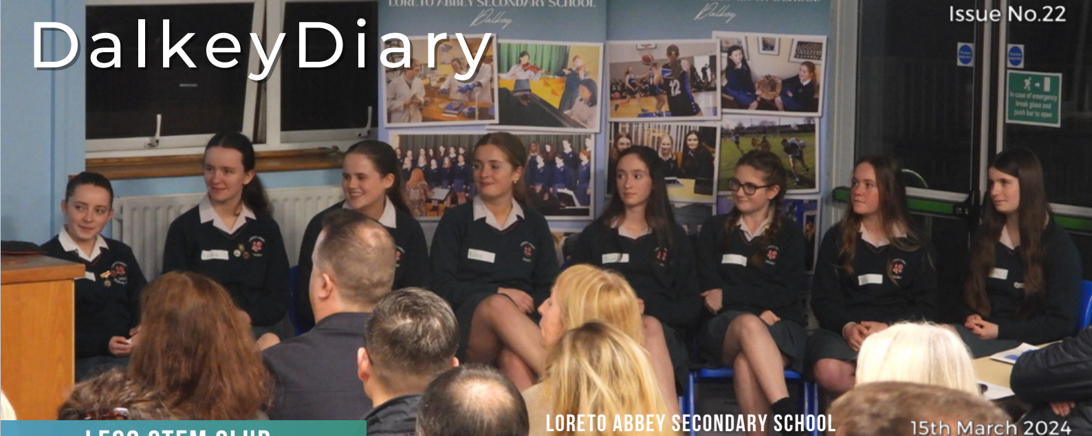
LORETO ABBEY SECONDARY SCHOOL