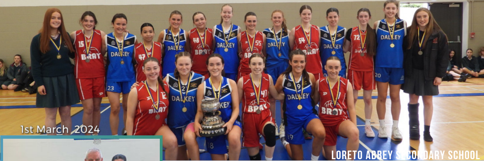
1st March 2024